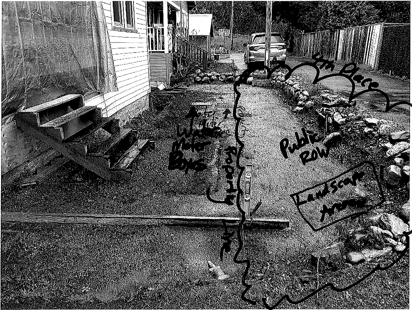
1535 4th Place Landscaping in Public ROW