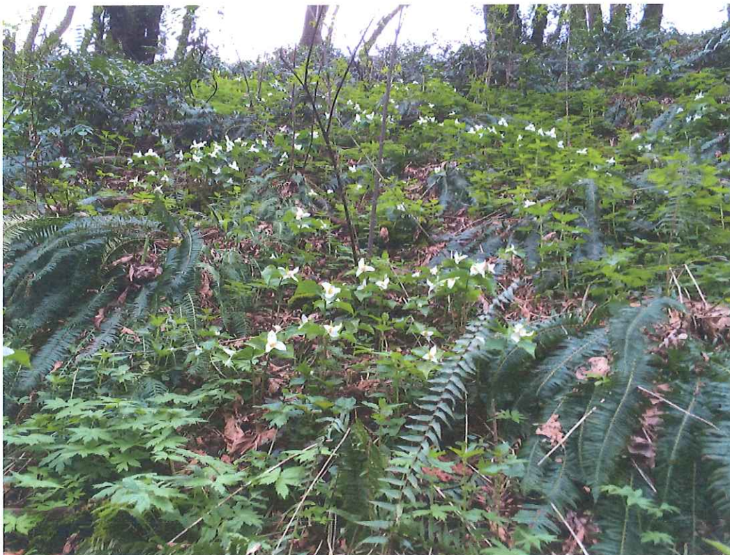
Trilliums bloom in abundance along the McBride Creek Trail