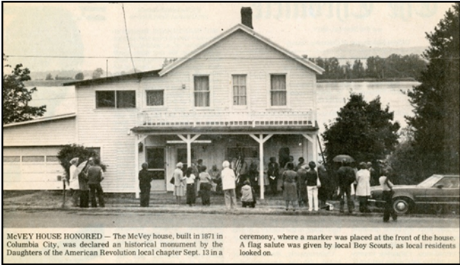
McVEY HOUSE HONORED - The McVey house, built in 1871 in Columbia City, was declared an historical monument by the Daughters of the American Revolution local chapter Sept. 13 in a ceremony, where a marker was placed at the front of the house. A flag salute was given by local Boy Scouts, as local residents looked on.