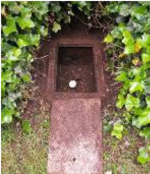
Good example of accessible meter

The water meter is City property and used to measure water usage by a residence or business. All meter boxes are located in the public right-of-way. In some areas the public right-of-way is very large and it may seem that the meter is located on your private property, when in fact it is not.