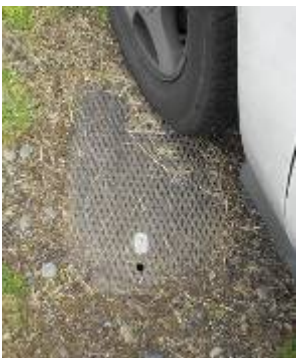
Blocked/Inaccessible meter box

On the other hand, septic tanks and their access lids can be located in the right-of-way or on private property. Not all properties have a septic tank as many homes are on direct flow for sewer services. If you are unsure where yours is located, please call the City.