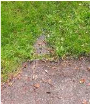
What not to do. Where is the meter box?