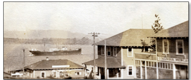
Looking down M Street between 3 d and 4 th